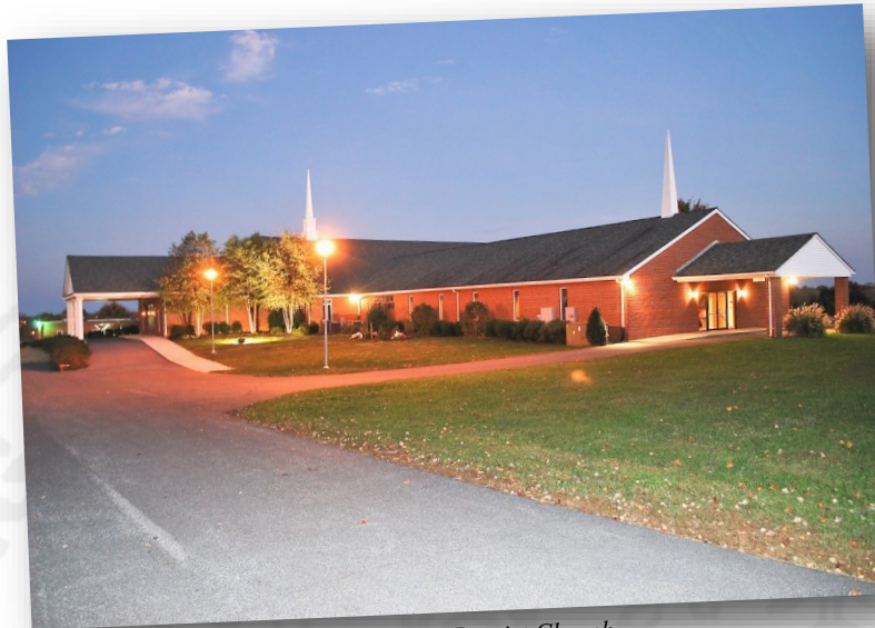
Chestertown Baptist Church

"The men's ministry at CBC is a ministry for every man, in every walk of life. Whether you're young, old, fast paced, or enjoy a slower walk of life you'll enjoy the fellowship of the men's min-