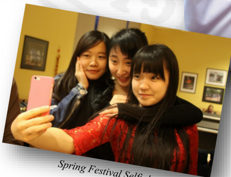
Spring Festival Selfie!