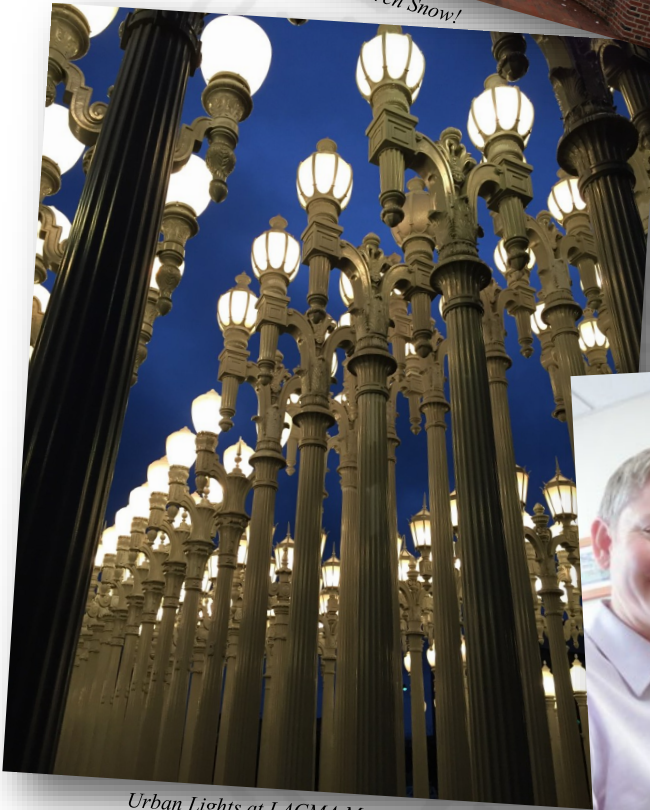
Urban Lights at LACMA Museum