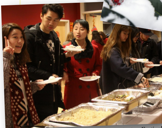
Traditional Chinese Food at WC campus Spring Festival