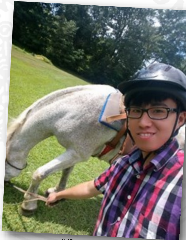
Selfie with Horse

After the horse finished eating grass, I touched its head. To my surprise, it didn't bellow, it was really kind. So I didn't feel nervous any more. I knew the horse will listen to me and be kind to me as long as I treat it with a sincere heart.