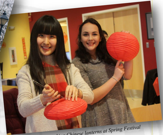
Students making Chinese lanterns at Spring Festival