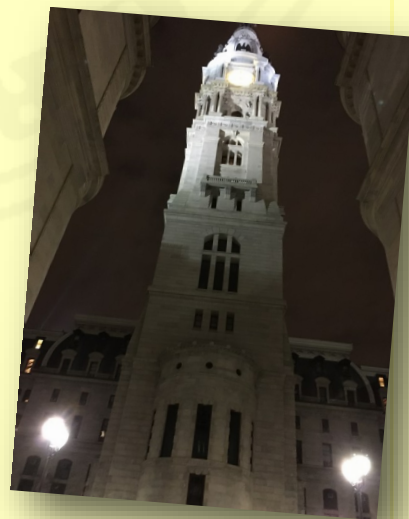
Philadelphia City Hall

The gorgeous view in Philadelphia impressed me, and I am looking forward to go to Philadelphia again.