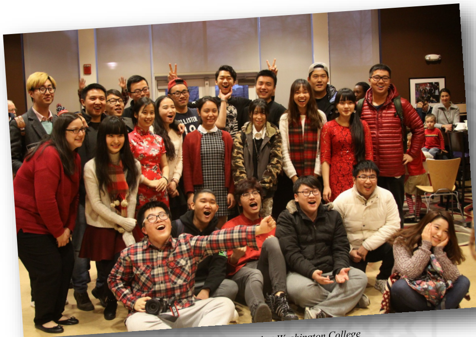
Celebrating Spring Festival at Washington College

At Washington College, the Chinese Student Union and the Global Education Office hosted a party to celebrate the Spring Festival in the Hadley Union Building, better known to students as the "HUB". While students, faculty, and administrators were enjoying delicious food as well as fun games and activities, a television broadcast celebrating the New Year was presented.