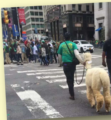
St. Patrick's Day in Philadelphia

The second day in Philadelphia was Saint Patrick's Day, walking