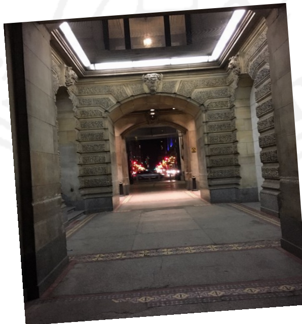
City Hall Entrance

I did not have green clothes, so I did not join the parade, I went back to the room