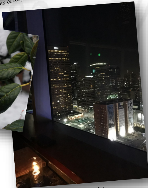
Night view in LA