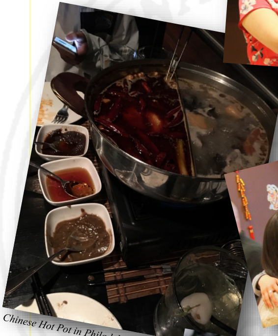
Chinese Hot Pot in Philadelphia's China-