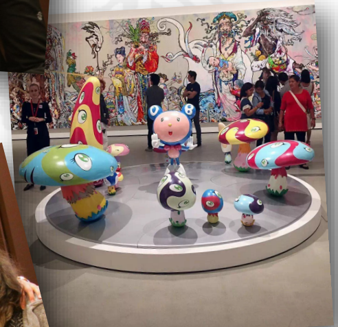
The Broad Art Museum in Los Angeles