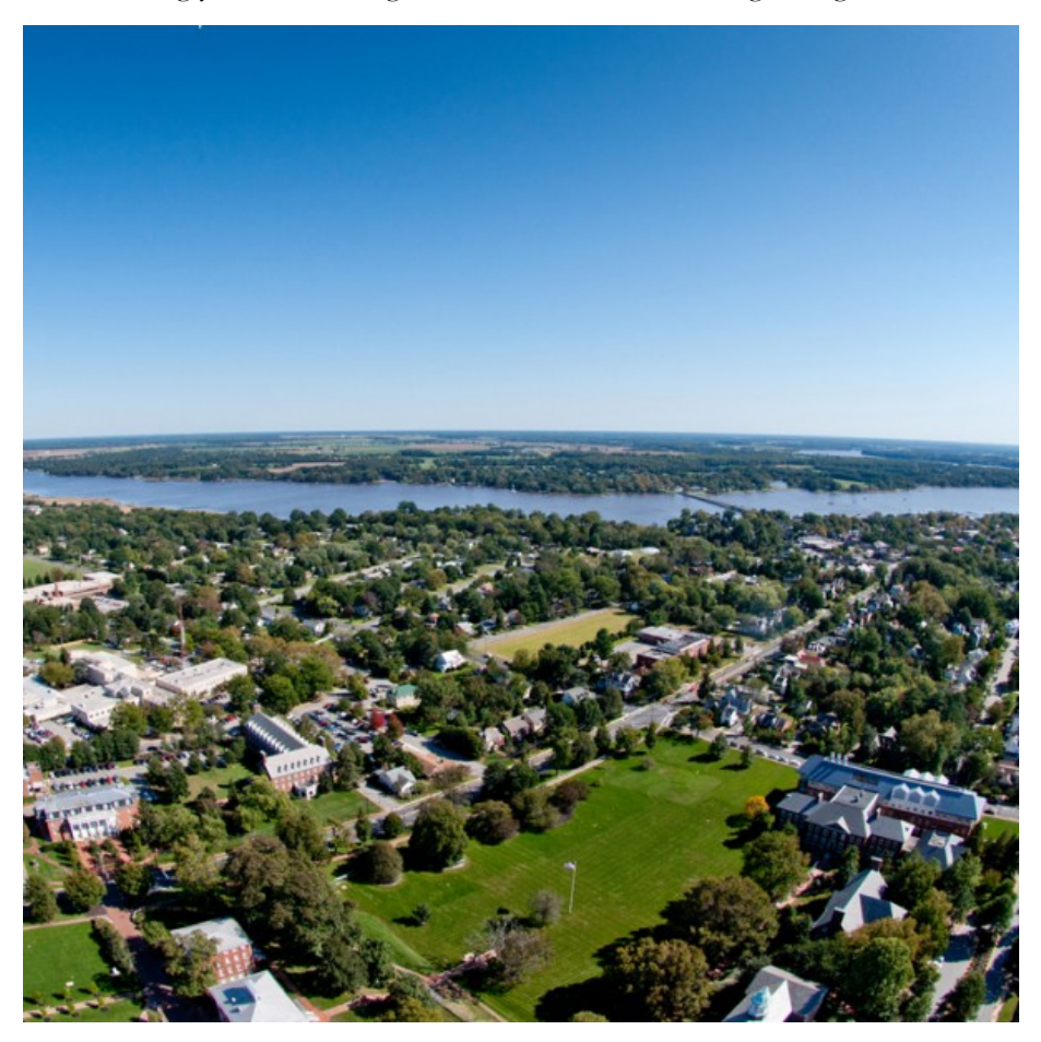
An aerial photo of Washington College and Chestertown

We look forward to meeting you and once again, we extend our warmest greetings!