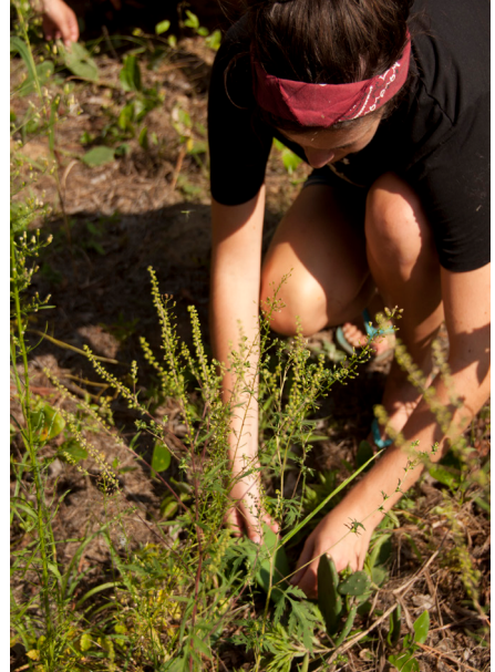
Top left: Sarah Giordano forages with the Chesapeake Semester at Chino. Above: Shannon Denno stops to inspect some plants on the farm. Opposite top: Snapping Turtle. Bottom Right: Brendyn Meisinger and Aaron Krochmal.

At night students planned to combine their cornicopic collection of wild edibles with freshly prepared venison. Cooked with wild spice-berry in a hollowed pumpkin using hot stones from the fire, this dish was going to the sizzle. Unannounced to the intrepid campers however, mothernature had different dinner plans. Threatening skies led to an evening thunderstorm that brought buckets of rain and gusts of wind up to 60 miles an hour. It was intense and so were the students! But with tall timbers all around, unfortunately it wasn't looking safe. In a frantic effort students packed up their belongings and jammed into the college van for an alternative meal at Higgy's diner.