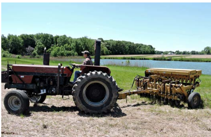
Top: A recently installed wetland in a soy bean field. Left: A contractor plants grass and wildflowers in a newly created buffer.