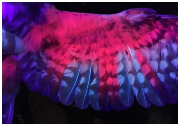
Top: Banders look at the wing of a Northern Saw-whet Owl. Left: Owl wing under blacklight shows molt limits, hot pink feathers have been recently replaced.

The nights in the lab are chilly and long, but if we're lucky enough to find a Northern Saw-whet Owl or two when we check the nets, it's all worth it.