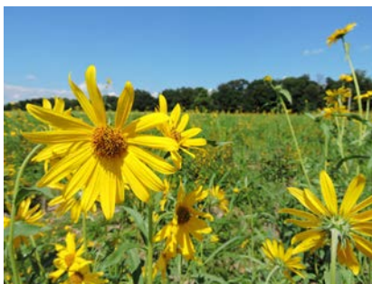
Top Right: Male Northern Bobwhite. Above: Native flowers included in buffer seed mixes improve diversity and attractiveness.

If you are interested in learning more about the Natural Lands Project please visit www.washcoll.edu/nlp or contact Dan Small at dsmall2@washcoll.edu .