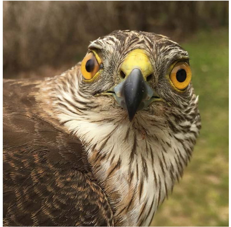
Above: Female Sharp-shinned Hawk originally banded in Cape May, New Jersey and recaptured at FBBO.